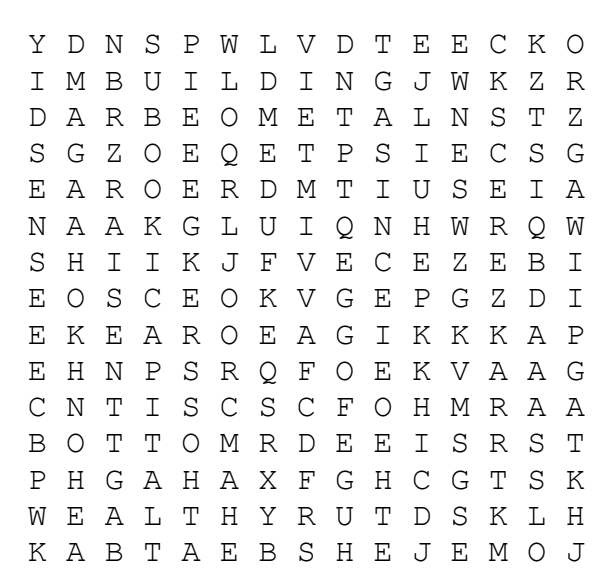
Figure 2 Self-sufficiency word search puzzle