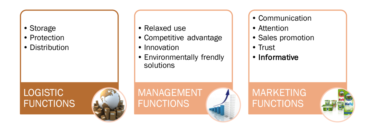
Figure 1 – Functions of packaging

Researchers are in unison as far as the increasing importance of packaging is concerned (Ampuero, Vila, 2006; Underwood, 2003, Underwood, Klein, Burke, 2001). Early studies focus primarily on the general features and roles of packaging design (Cheskin, 1971; Faison, 1961; 1962; Schucker, 1959), its communicational role (Gardner, 1967; Lincoln, 1965), or how it influences a brand (Banks, 1950; Brown, 1958; McDaniel, Baker, 1977; Miaoulis, d'Amato, 1978).