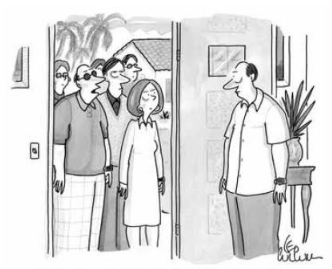
"We're from the Neighborhood Watch committee. We've heard you're wearing a fake Rolex."