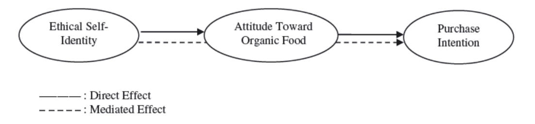
Figure 5. Motivation of occasional buyers

Hypothesized Links for Occasional Buyers