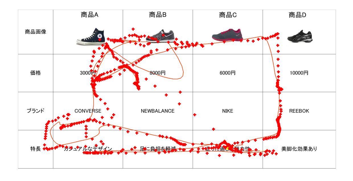
Fig. 3 Selection Screen

Four choices with four attributes (product image, price, brand, and features) are displayed, and the participants select one of these products after viewing each of them. The red marks denote the movement of the participants' point of gaze.